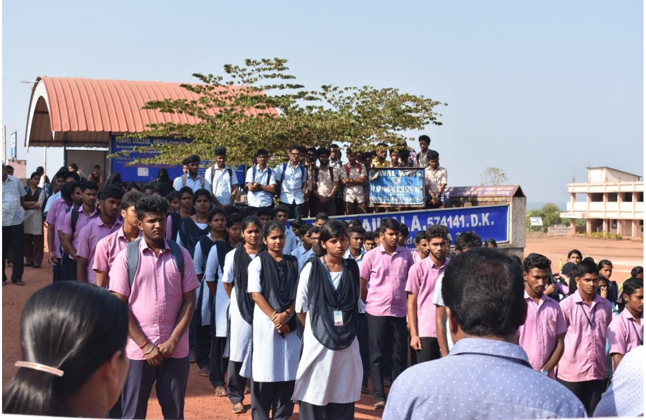
23.03.2019: Competition Swarna 2019 at Milagres College Kalyanpur