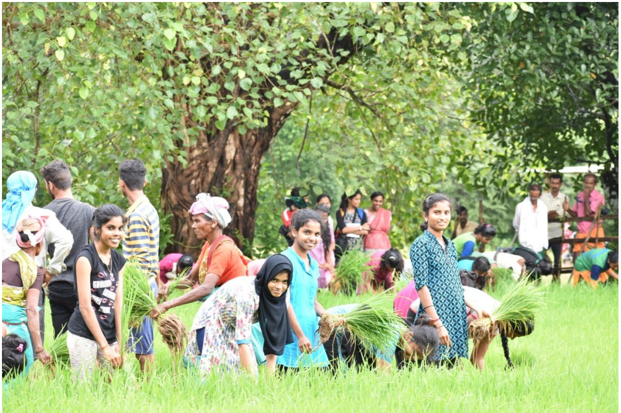
15.08.2018: Independence Day programme