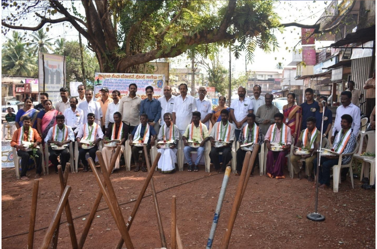
05.12.2018 to 11.12.2018 Annual Special camp at Sri Babuji Higher Primary School Kallamundkur, Niddodi