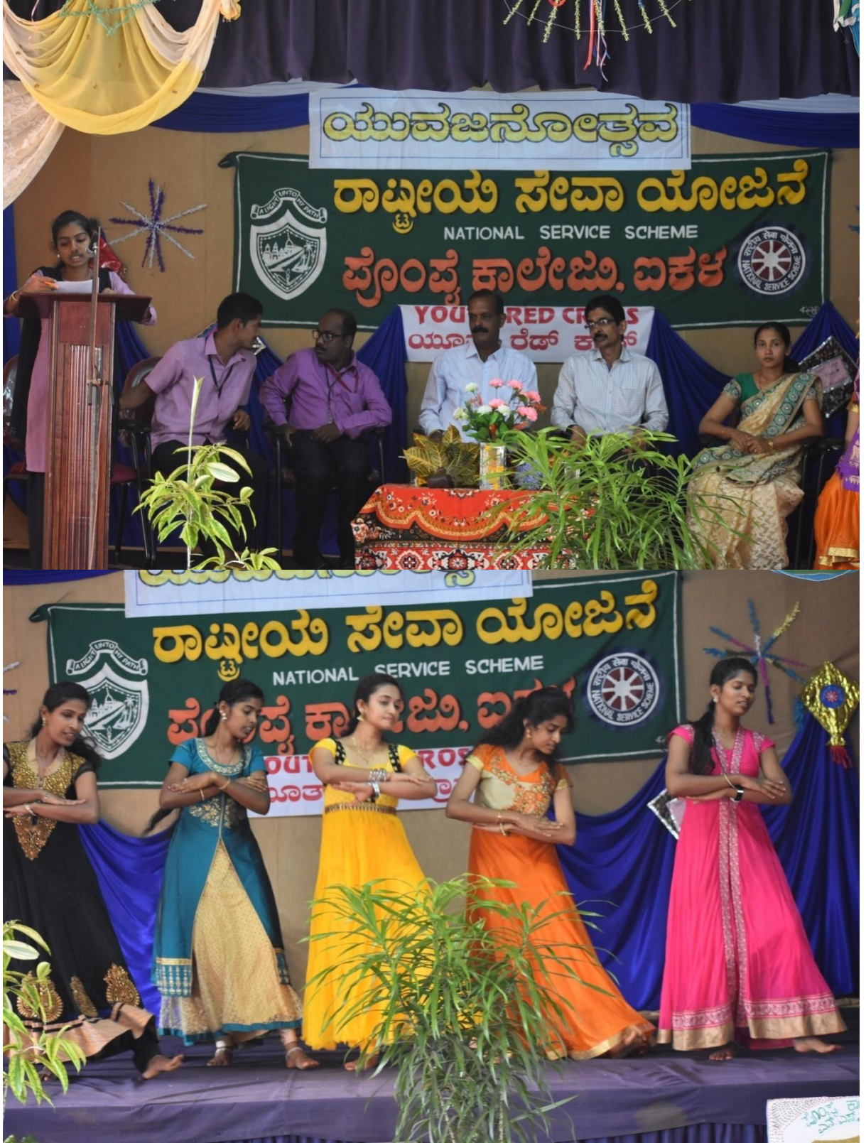
02.02.2019:AIDS Awareness programme; AIDS Skit Competition