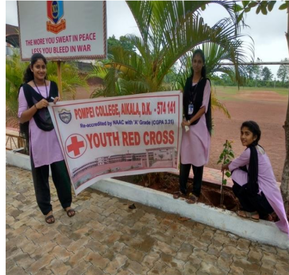
YRC celebrated the World Environment Day by planting the saplings