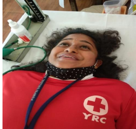
Youth Red Cross volunteers donated their blood