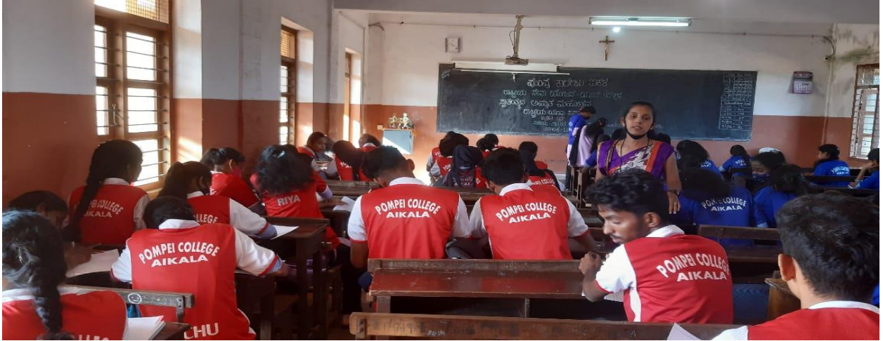
Participation of YRC volunteers in drawing competition.