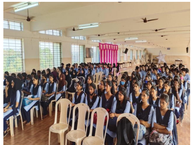
Volunteers present in the inauguration