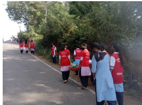
Youth Red Cross unit cleaned the premises from Pompei college to Damaskatte