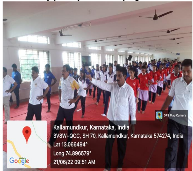
Yoga Day was celebrated by the YRC