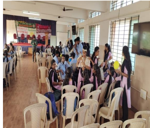
PO's of YRC, NSS, Leaders and Principal with resource person Volunteers doing the task assigned during the workshop