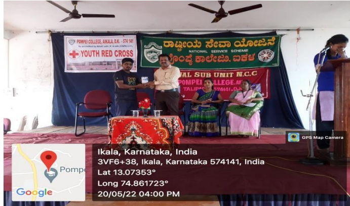
NSS officer honoring the resource person and YRC PO's on the dias