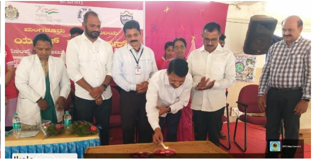
Inauguration the annual Camp