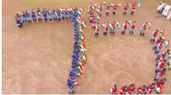
YRC & NSS volunteers depicting the azadi ka amrit mahotsav