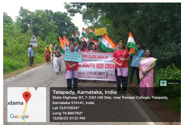
YRC in the rally