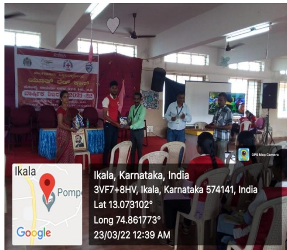
Session on fuel independence was conducted for the volunteers