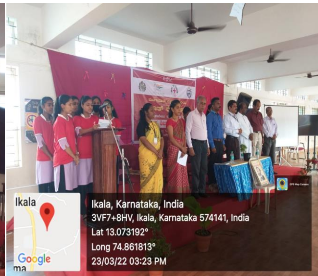
Valedictory session of the YRC Camp 2021-22