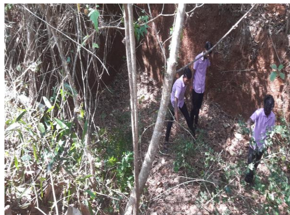
Volunteers engaged in cleaning