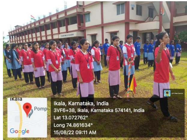
YRC celebrated the independence along with NSS & NCC