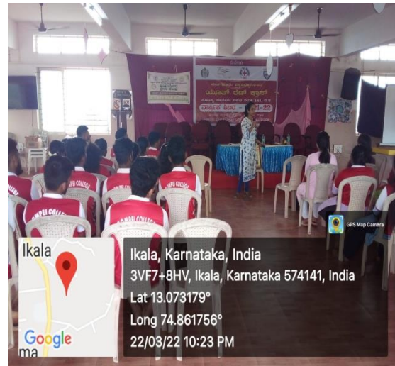
Volunteers and resource person in the First aid Session